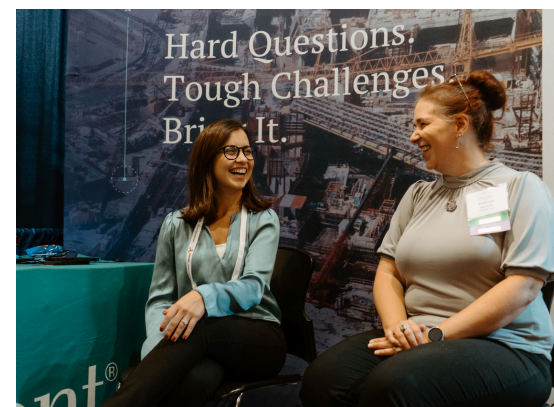
Exhibit Hall Hours: September 23-25, 2025